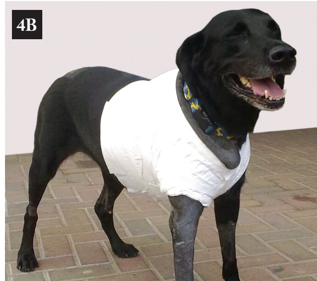
Figure 4a&b: A photograph of the dog three days postoperatively. The drain was removed and the bandage was maintained for two weeks.

ling over of the manus. Thirty six hours postoperatively the neurological deficits resolved and after 2 weeks the dog was walking without lameness.