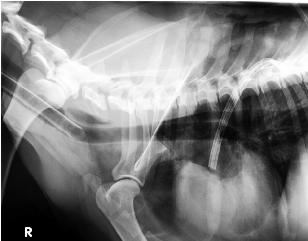
Figure 3: A lateral postoperative radiograph of the scapula showing the defect in the caudal scapula.

neck of the scapula caudal to the spine of the scapula. The neck of the scapula caudal to the spine of the scapula was then cut with an oscillating saw and the scapula was cut caudal and parallel to the spine of the scapula, from the proximal margin of the scapula to the osteotomy of the caudal aspect of the neck of the scapula (Figure 2). The subscapularis muscle was identified and cut parallel to the osteotomies of the scapula. The serratus ventralis muscle could now be identified and was cut similarly.