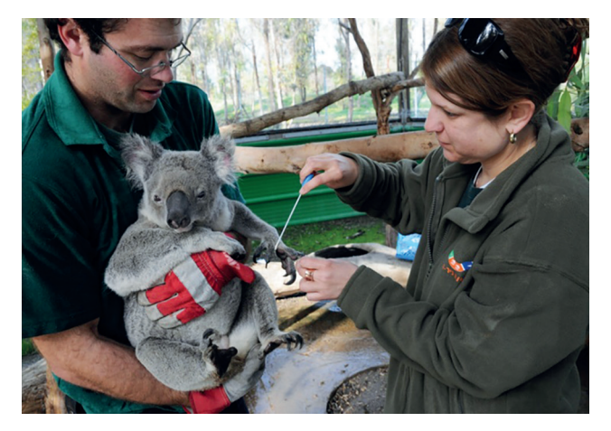
Figure 2: Sampling the koalas.

The koalas' sera were examined for Cryptococcal antigen using a commercial kit (Cryptococcal Antigen Latex Agglutination System (CALAS®), Meridian Bioscience, USA).