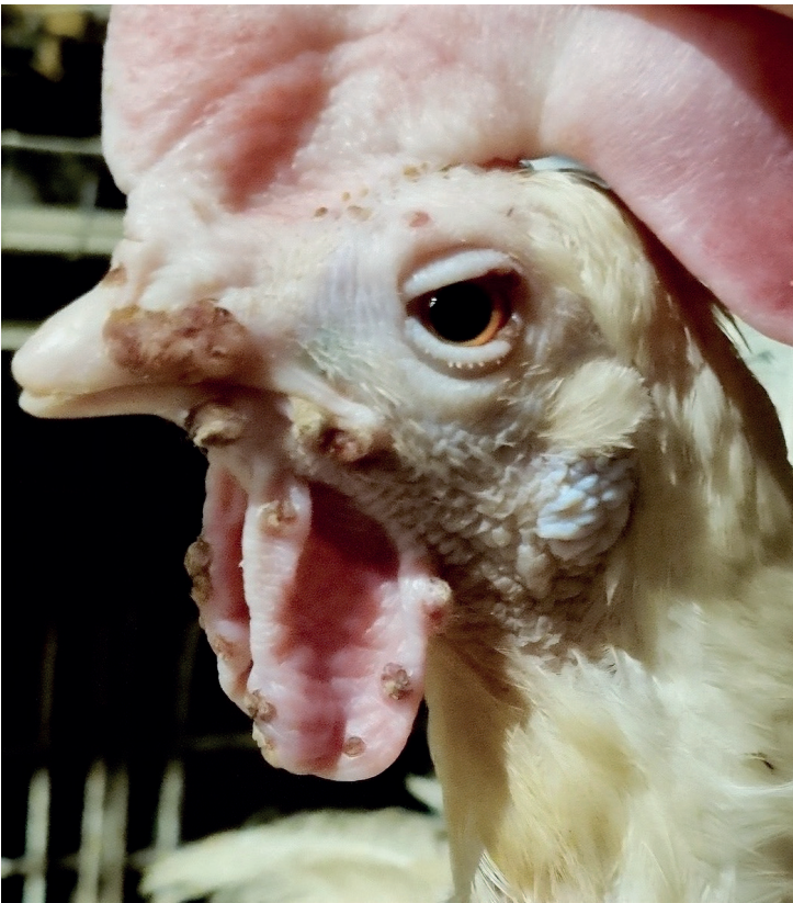
Figure 1. Cutaneous Pox lesions in layer hen vaccinated at 14 days old and 7 weeks, by the WW stab method