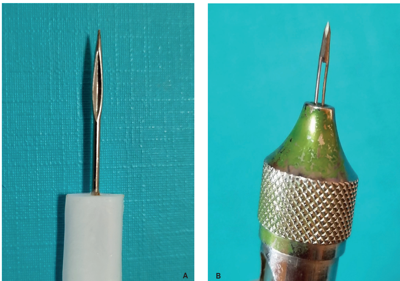
Figure 4. Calibrated grooves in the manual applicator (A) and the semi-automatic Pox-Syringe (B).

Sub-cutaneous vaccination: The field studies were performed using three different types of syringes depending on the required volume of diluted vaccine to provide one dose/bird.