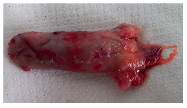
Figure 1: Picture of the adult female saki's tongue in this report, showing HSV lesions of the ulcerative glossitis.

The histopathology of the male's lesions showed focal areas of oral mucosal erosion and ulceration with marked swelling of squamous epithelial cells and the presence of intranuclear inclusion bodies (Figure 3). The areas of erosion were infiltrated by neutrophils. The hepatocellular parenchyma had focal areas of necrosis with macrophages present, but no intranuclear inclusion bodies were observed. The brain cortex of the 3-years-old female had a few random neuronal necrotic foci which could have explained her severe