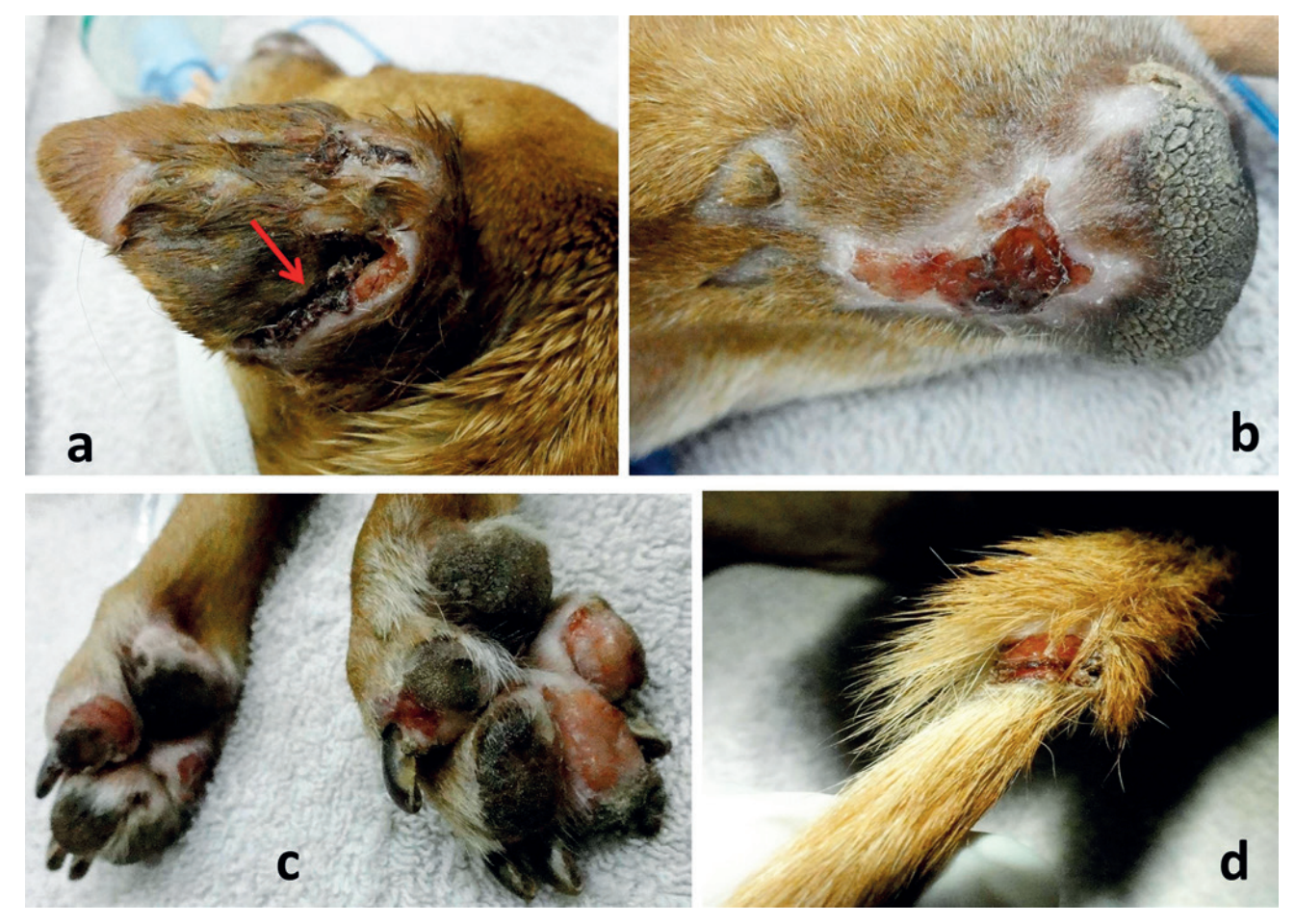
Figure 1: (a) Left pinna; Note the alopecia, necrosis and ulcerations, with sero-sanguineous exudate and full thickness fissure, extending horizontally throughout most of the pinna (arrow); (b) Note the alopecia and ulcerations with crusts on the dorsal aspect of the distal muzzle and nasal planum hyperkeratosis; (c) Ulcerations of variable severity in the paw-pads of both hindlimbs; (d) An ulcerated lesion with sero-sanguineous secretions at the distal tail.

aspect of the muzzle showed alopecia, extensive crust-covered ulcerations, and nasal planum hyperkeratosis. The footpads of both hindlimbs and the left frontlimb showed ulcerations of variable severity. Ulceration on the tip of the tail was also noted (Figures 1a-d).