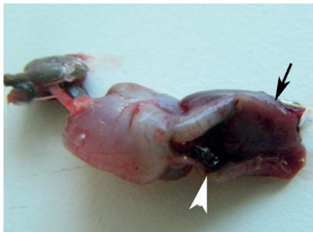
Figure 2: Thickening of the proventricular walls (arrow) and hemorrhage of the proventricular mucosa (arrow head).

At necropsy, atrophy of the pectoral muscle was most commonly observed in dead birds affected by megabacteriosis. Thickening of the proventricular and ventricular walls, covering of the proventricular mucosa by thick white mucus, ulceration and hemorrhage of the proventricular and ventricular mucosa, loosening of the koilin layer and hemorrhage into the lumen of these organs were commonly observed (Figure 2). In addition marked hemorrhage in the small intestinal wall and into the lumen were also observed. The most severe histopathological lesions were seen in the proventriculus and, in some cases the ventriculus, including penetration of organisms into the lumen of the superficial proventricular crypts and occasionally to deep-