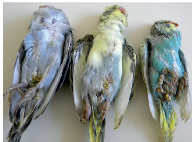
Figure 1: Feces around the anus, diarrhea in three budgerigars which died from combined infection coccidiosis and megabacteriosis.

The severity of gut lesions was assessed by scoring hemorrhages and inflammatory reactions in birds with single or dual infections. Each criterion was graded on a scale of 0 to 4 as follows: 0= no lesion, 1= focal slight, 2= focal severe, 3= diffuse slight and 4= diffuse severe. Data from each animal was analyzed statistically. One-way analysis of variance was used to detect any differences between the single and dual infection groups. The non-parametric Duncan multiple com-