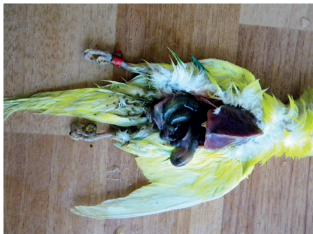
Figure 3: Hemorrhagic areas in gut in a budgerigar, died from combined infection.

The owner stated that after transport of the birds from the hatchery to the aviary the budgerigars gradually became emaciated and mortality increased. Birds presented with diarrhea and accumulation of dried feces around the cloaca, which in some individuals formed a packed obstruction or plug. At necropsy of the dead birds, atrophy of the pectoral muscles was observed, with hemorrhage of the proventricular mucosa adjoining the transition to the gizzard. Blood was also seen in the intestinal lumen. Examination of impression smear without staining of the gut contents revealed numer-