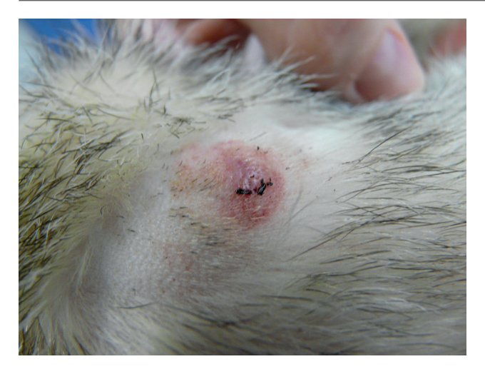
Figure 1: Image of this ferret at presentation showing the raised dermal mass on the head.

mask with 5% isoflurane gas (IsoFlo; Abbott Laboratories, North Chicago, IL USA) in 2L/min oxygen. Following induction, the ferret was maintained under general anesthesia using a fitted face mask and non-rebreathing circuit using 2.5% isoflurane delivered via 1.5 L/min of oxygen. Body temperature was monitored rectally using a handheld digital thermometer and maintained using a warm water blanket and heating packs. Vital signs were monitored using a stethoscope, a Doppler (Parks Doppler System Model 811-B; Parks Medical Electronics, Inc., Aloha, OR USA) and a pulse oximeter (Nellcor Handheld Pulse Oximeter N20PA, Covidien, Dublin, Ireland). The area around the mass was aseptically prepared using a standard technique. A full thickness biopsy of the mass on the head was obtained using a disposable Baker's biopsy punch (SklarTru-Punch disposable biopsy punch, 5 mm; Sklar, West Chester, PA USA). This also resulted in complete excision of the mass. The surgical site was closed using 4-0 polydiaxone monofilament absorbablesuture (PDS II ™; Ethicon, Somerville, NJ USA) in a simple cruciate pattern. Flumazenil (0.05 mg/ kg intramuscularly; Ben Venue Labs, Bedford, OH USA) was given to assist an uneventful anesthetic recovery. The tissue was placed in 10% buffered formalin and submitted for histopathologic examination.